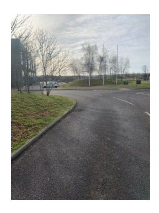
BY HAND TO: Horizon Centre (annex) Broadland Business Park Peachman Way Norwich NR7 0WF