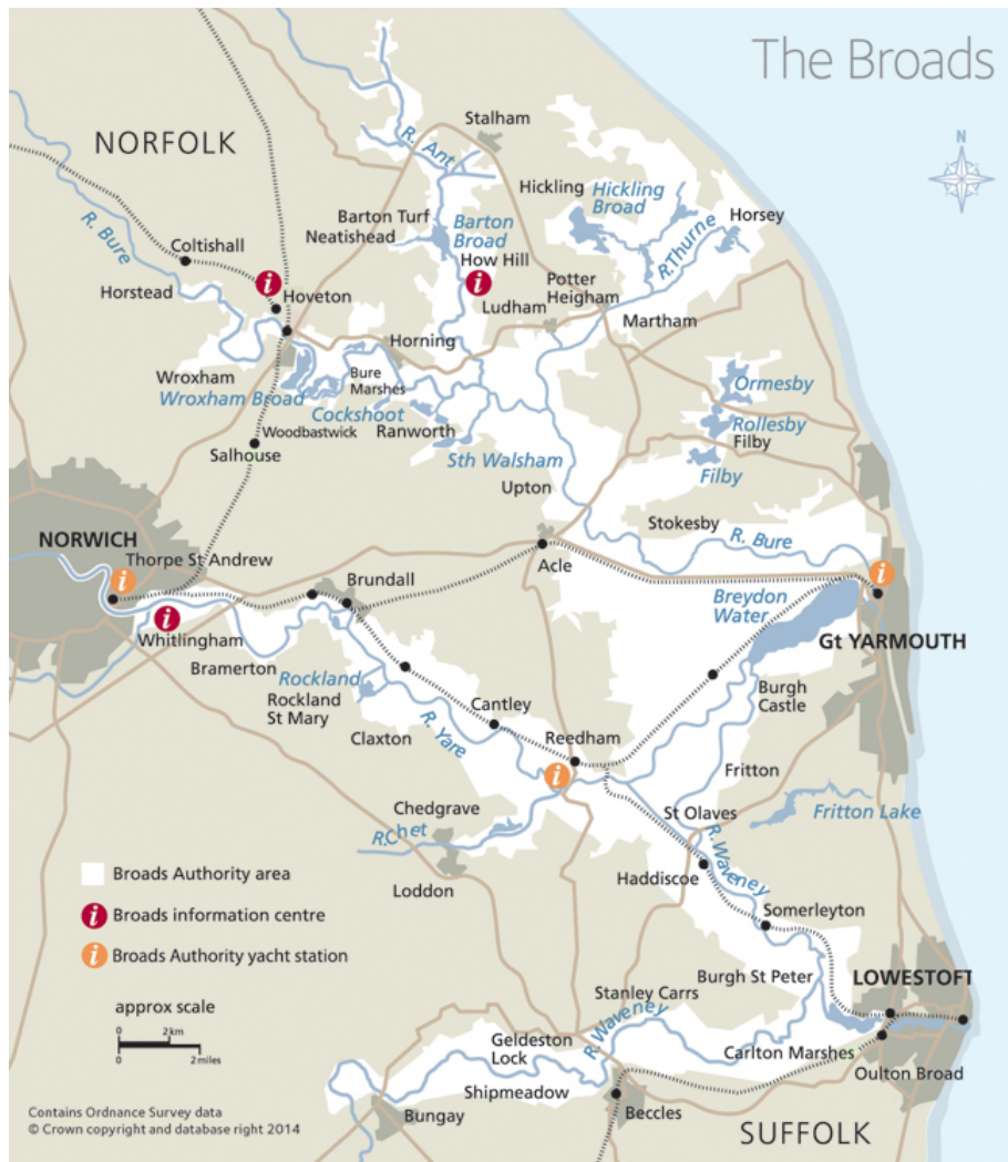
Map 1 Broads Authority executive area