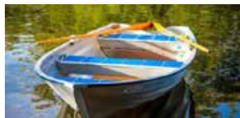
Our 3&4 man picnic boats are the ideal rowing boat to head along the river without the noise of a motor.