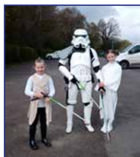
Star Wars inspired Community Litter Pickers

The community litter pick was a brilliant event and we managed to fill a skip worth of rubbish from around the town. A huge thank you to all who turned out on a miserable day and braved the hail and rain to take part. We were delighted to see so many families turn up and all the children were super enthusiastic - some even borrowing litter pickers to carry on the good work we had started. Look out for more information re: future events and how to take part.