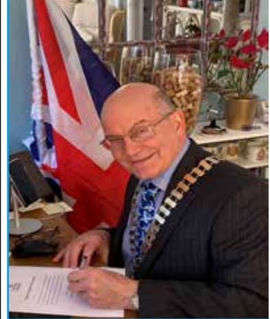
Former Mayor Signing the Armed Forces Covenant March 2020

We are delighted to announce that Thorpe St Andrew have recently signed the Armed Forces Covenant.