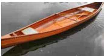
Hand made in our workshop, these Canadian canoes are stable, fast & easy to manoeuvre. Max 3 people.