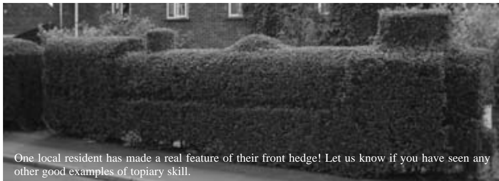
One local resident has made a real feature of their front hedge! Let us know if you have seen any other good examples of topiary skill.