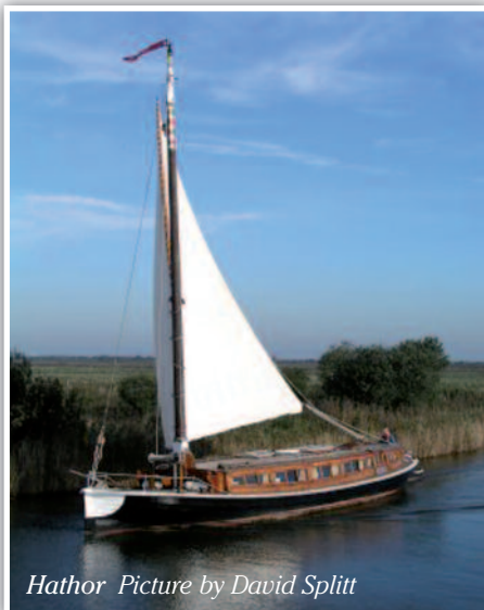
Hathor

The Broads Authority wherry tour is expected to arrive on River Green, Yarmouth Road at about 10am. The boat used this year will again be the wherry Hathor and 2009 is particularly significant as it will be Hathor's last tour for a number of years. She was built in 1905 for the Colman family (of mustard fame) and there is an intriguing story behind the beautiful and unusual Egyptian-themed decoration below decks. Come along and see for yourself and the volunteer crew will be pleased to tell you the story.